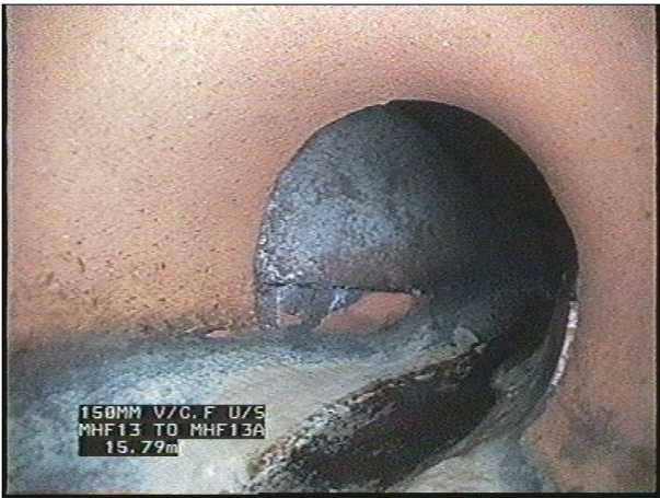
Photo: 22_13a, Tape No.: 2581, 00:22:07 15.7m, Line of Sewer deviates right, Remark: SLIGHT