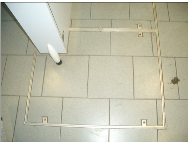
Photo: 2_15b, Tape No.: 2581, 00:22:19 16.1m, Manhole Remark: MHF13A, IN STORE IN TOILET BLOCK UNDER CUBICLE, UNABLE TO RAISE.