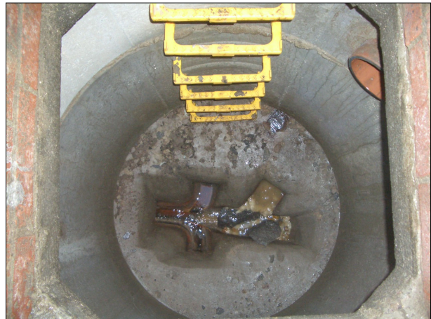
Photo: 2_2a, Tape No.: 2581, 00:18:15 0m, manhole Remark:MHF13 (DEBRIS IN MANHOLE)