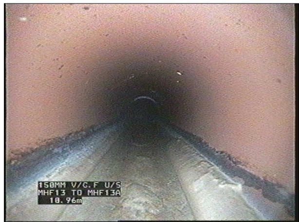
Photo: 18_9a, Tape No.: 2581, 00:20:50 10.9m, Debris grease, from 05 to 07 o'clock, 10 % cross-sectional area loss, Changed