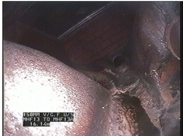
Photo: 24_15a, Tape No.: 2581, 00:22:19 16.1m, Manhole Remark: MHF13A, IN STORE IN TOILET BLOCK UNDER CUBICLE, UNABLE TO RAISE.